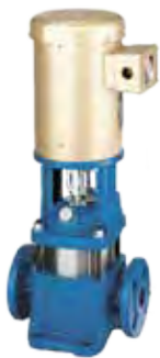
Models PVM & PVMX