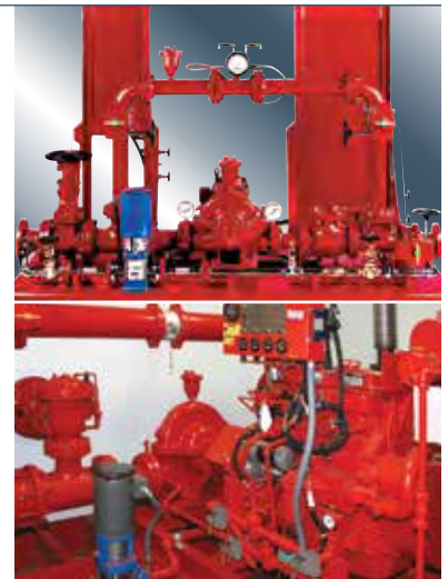
Pictured at top: Packaged Fire Pump System.

As an ISO 9001 registered company, Aurora Pump is committed to quality. In addition, to meet your time-critical requirements, Aurora offers the Red Hot quick ship program for total fire pump packages. Along with our outstanding customer service, Aurora will keep your fire pump system at peak performance for years to come. You can rely on Aurora Pump and our qualified distribution network to provide total pump solutions for fire protection.