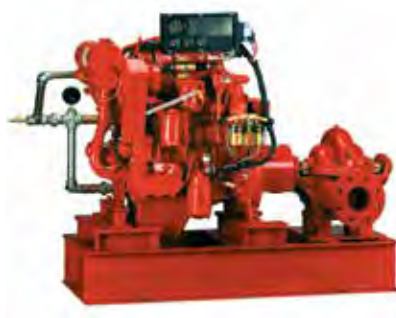
Models 481, 485, 491, 492, 495